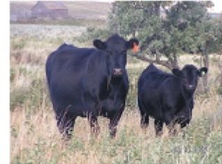
Over 3,600 producers across Canada have taken a VBP workshop.